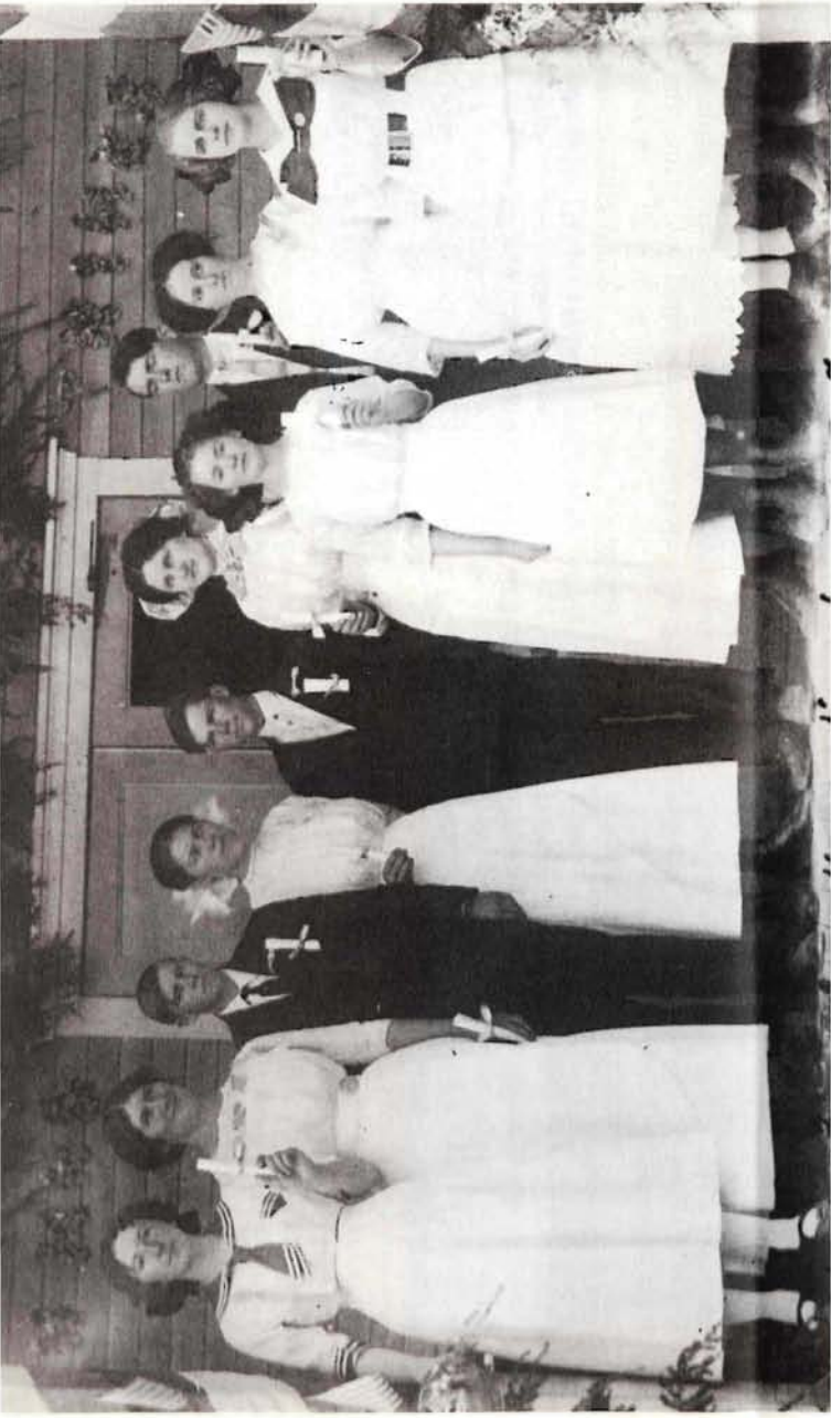
Annville Institute, Jackson County Ministries Collection, Berea College Southern Appalachian Archives