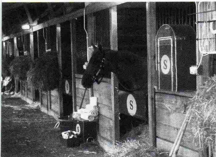
Thoroughbred horses require vast amounts of straw and hay for bedding and feed — which eventually make great feedstock for composting.